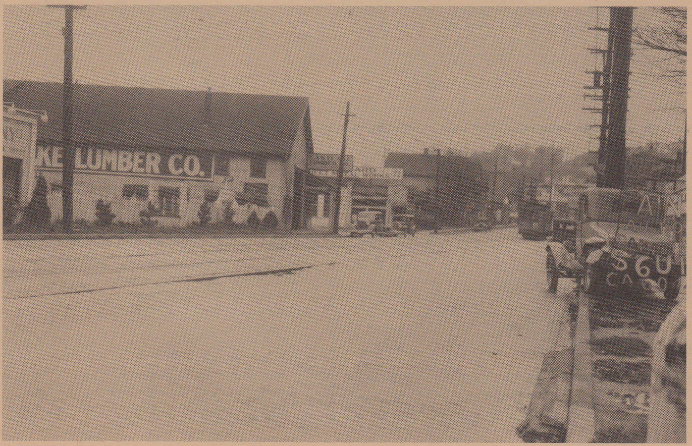
Here are scenes along Eastlake Avenue in 1927 and 1933. We need your help in identifying the locations, and any memories or records of what the street was like in those days. Please write us at: Eastlake Archives, c/o ECC, 117 E. Louisa #1, Seattle 98102.